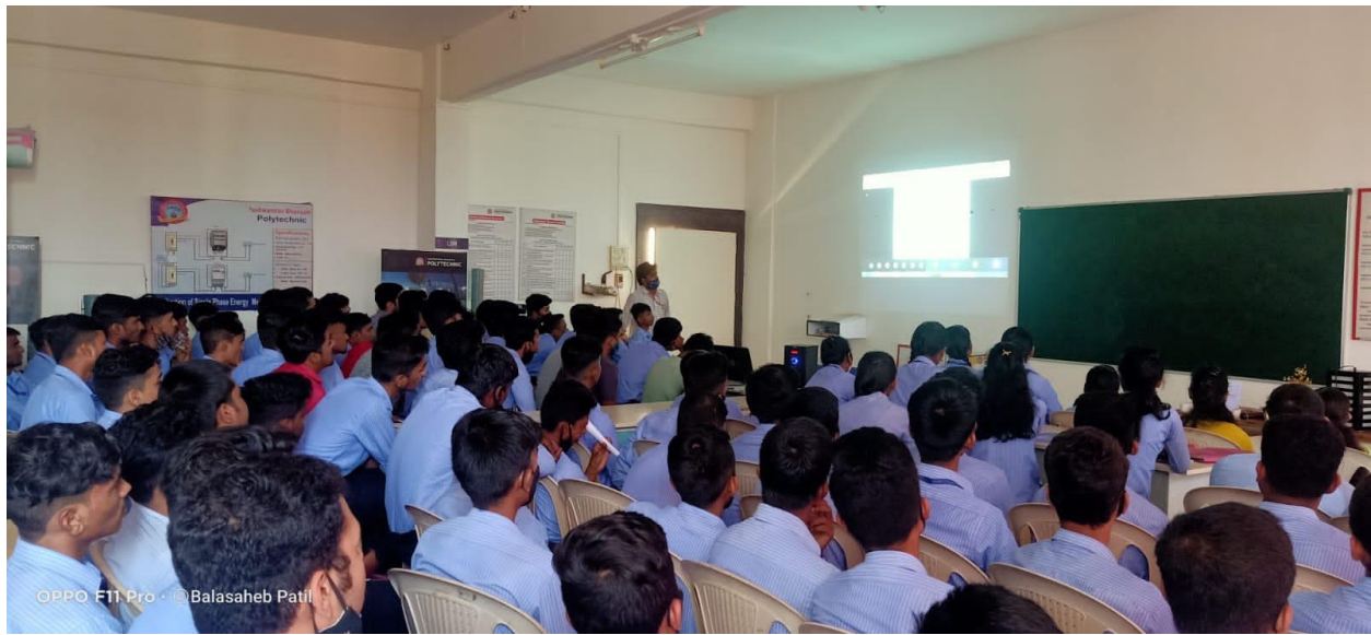
Yashwantrao Bhosale Polytechnic, Sawantvadi students attending the webinar.