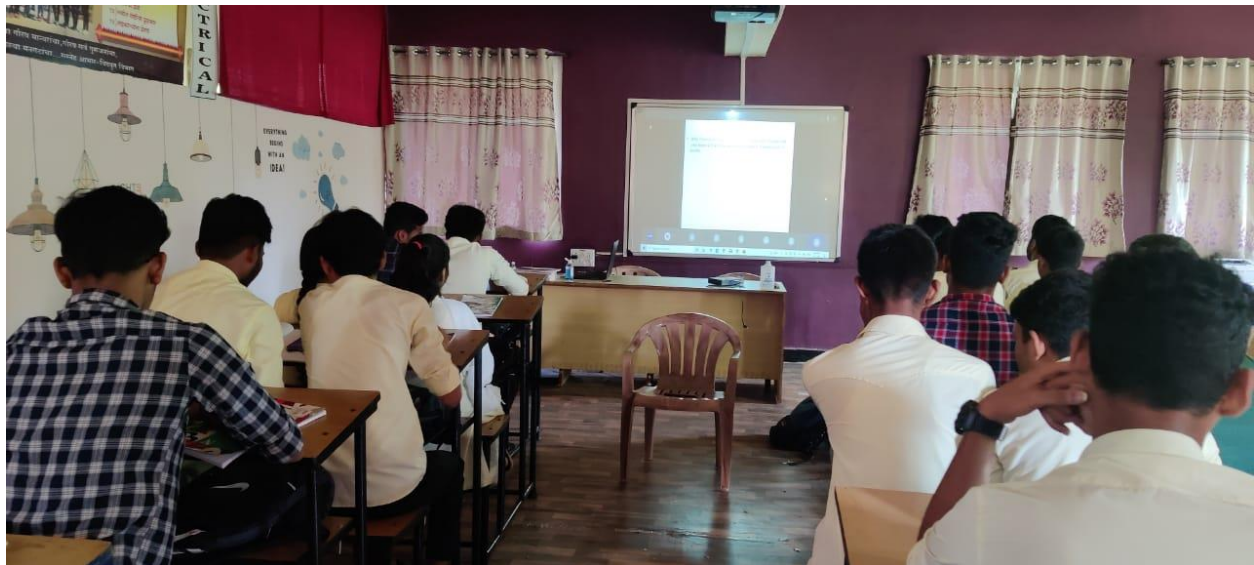
(Students from Mandar Diploma College attending the webinar)